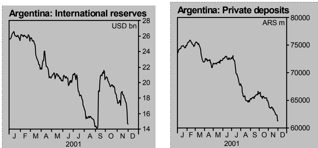
Figure A1. Argentina